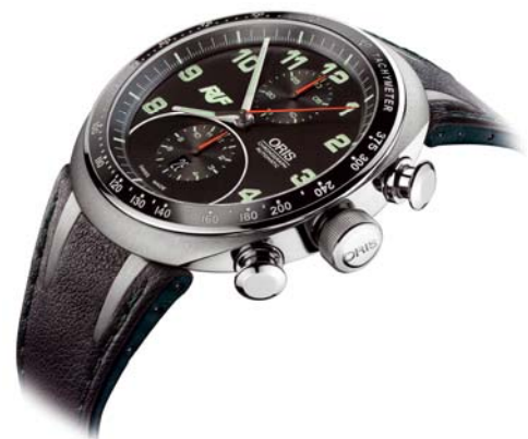
The Oris RUF CTR3 Chronograph Limited Edition

Oris RUF CTR3 Chronograph Limited Edition Ø44.50 mm Ref. 673 7611 70 84 LS